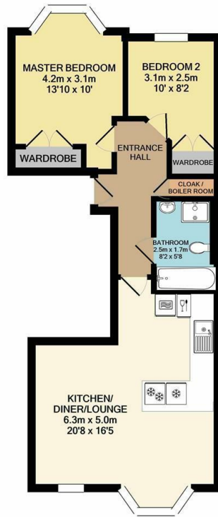
TOTAL APPROX. FLOOR AREA 54.8 SQ.M. (590 SQ.FT.) Measurements are approximate. Not to scale. Illustrative purposes only Made with Metropix ©2020